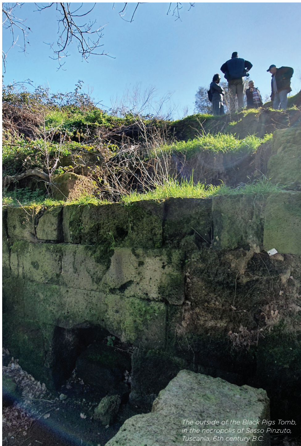
The outside of the Black Pigs Tomb, in the necropolis of Sasso Pinzuto, Tuscany, 6th century B.C.