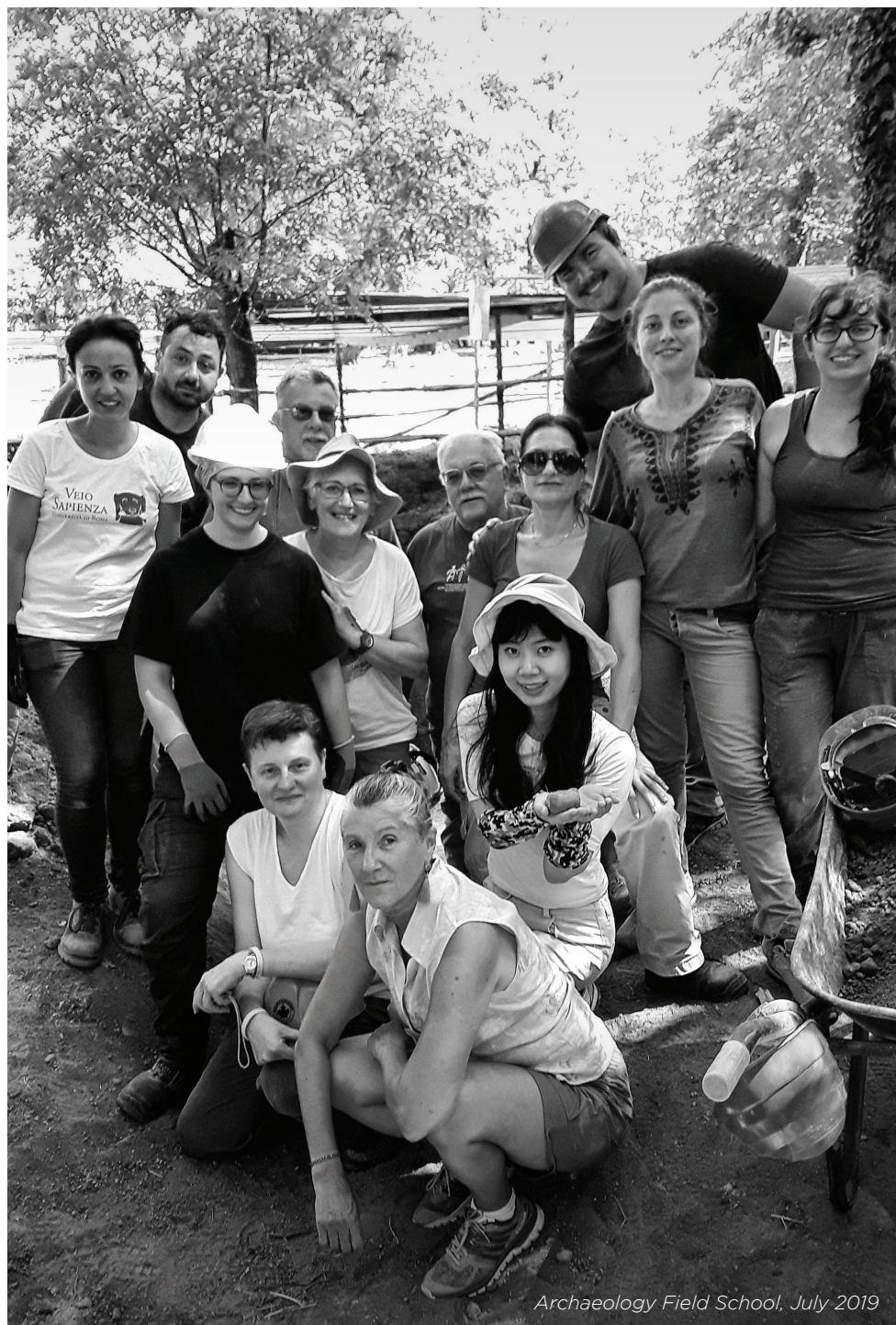
Archaeology Field School, July 2019