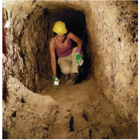
Archaeologist exploring a tunnel in a tomb.