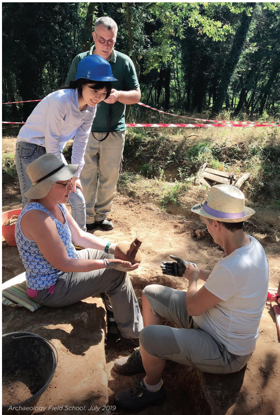
Archaeology Field School, July 2019